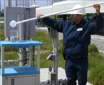
Water Treatment Operator