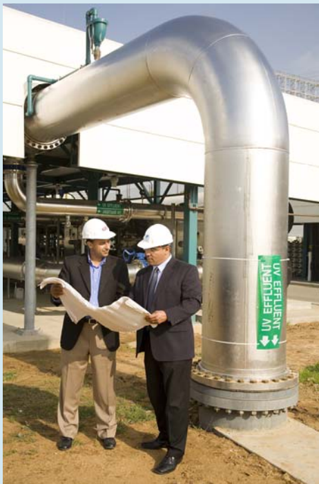
Water Resource Planner