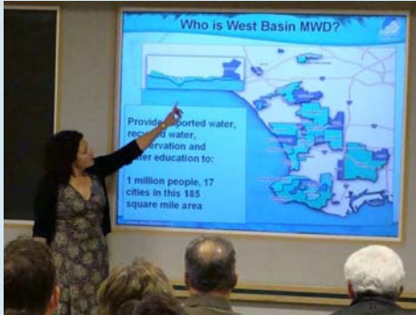
Public Information Officer