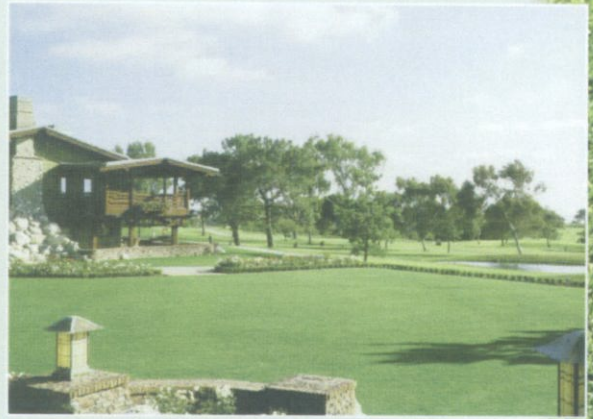
Recycled water on golf courses is increasingly common. Located in La Jolla, California, Torrey Pines Golf Course offers two of the most picturesque championship 18-hole golf courses in the world.

It is the only CD database of its kind that provides information on the effects of water quality on plants, soils, and water application systems.