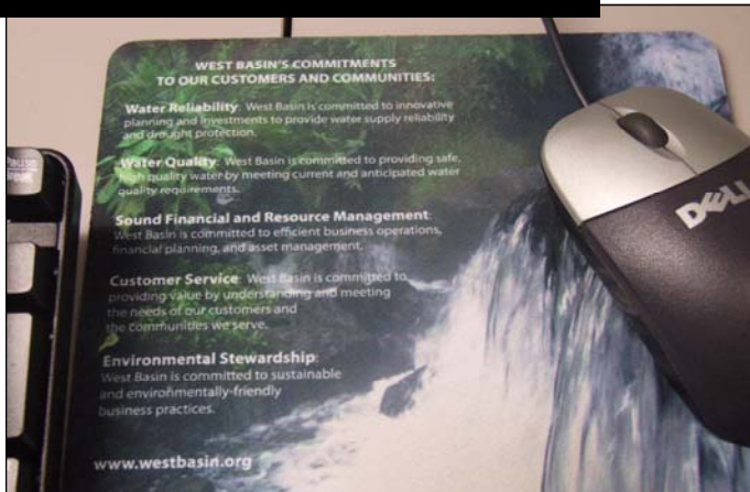
Mousepads for Staff, Directors and Customer Agencies