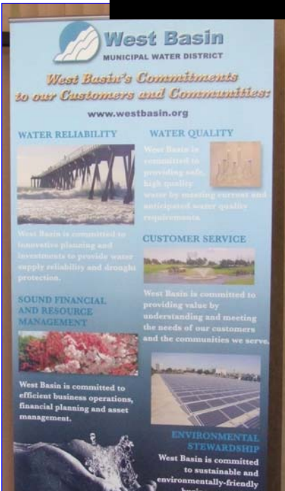
6 Foot Tall Banners for the Lobby and Special Events