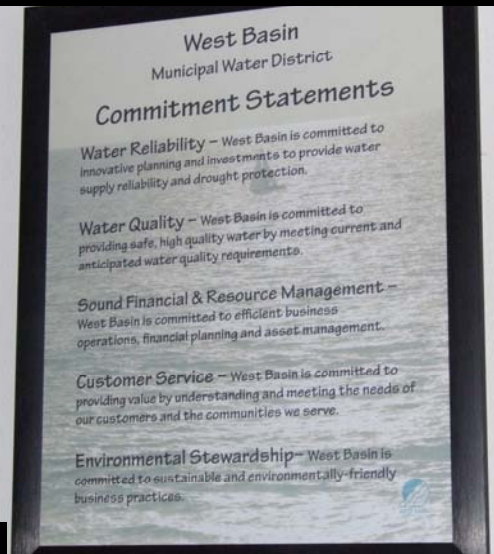
Conference and Board Room Posters