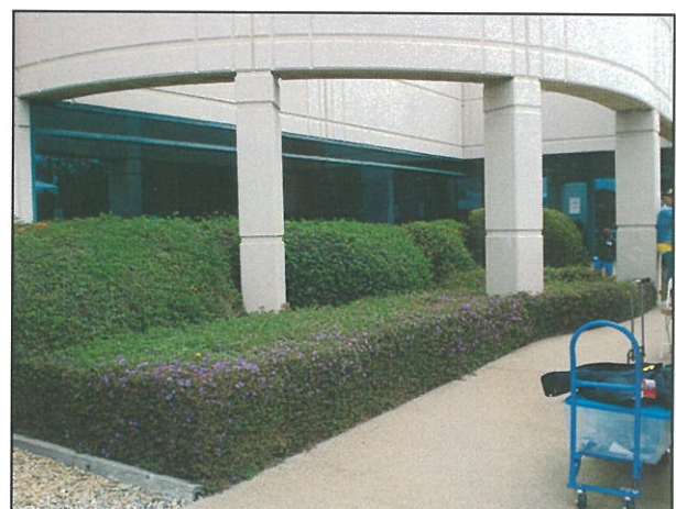
Photo shows the right side of the garden in front of the building