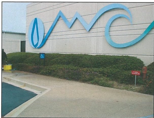
Photo shows the left side of the garden in front of the building