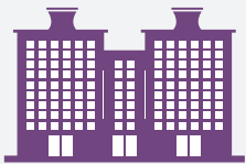
Office buildings and manufacturing

Squeezing the most out of each drop of recycled water