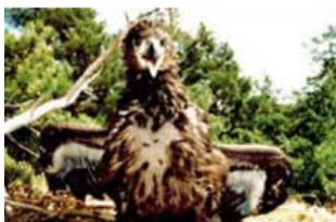
A white-tailed eagle chick observed recently in the Chernobyl Exclusion Zone. Before 1986, these rare predatory birds were hardly found in this area (Sergey Gaschak, 2004).

PARADOX: Over the years, as the radioactivity levels decrease, the biological populations have been recovering. Some of the populations have recovered and grown because individuals reproduced or because plants and animals migrated from less affected areas. Human activities such as agriculture or industry have stopped in the area which has helped recovery. Paradoxically, the Exclusion Zone without any human activity has become a unique sanctuary for biodiversity and a lab to study both affects of radiation as well as recovery.