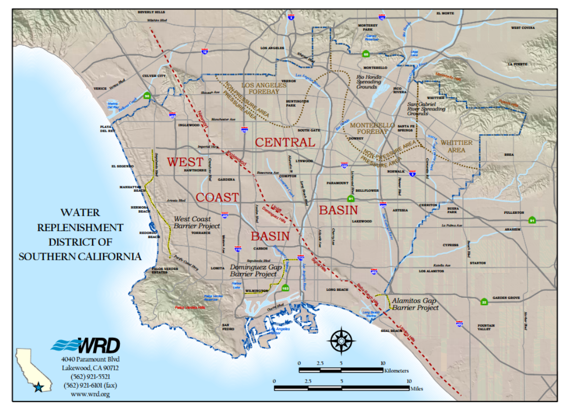
— West Basin Ocean Water Desalination Project Figure 7-2 West Coast Groundwater Basin

In 2014 regulations were adopted by the State of California for groundwater replenishment using recycled water. The SWRCB's Division of Drinking Water (DDW) administers the regulations which requires the use of an environmental buffer for any IPR project. Under the Indirect Potable Reuse Alternative, the only available environmental buffer within West Basin's service area is the West Coast Groundwater Basin (Basin). The Basin underlies 160 square miles in the southwestern part of the Los Angeles Coastal Plain in Los Angeles County. The Basin extends southwesterly along the coast from the Newport-Inglewood Uplift to the Santa Monica Bay; refer to Figure 7-2 . The Basin provides groundwater to approximately 11 cities and unincorporated areas of Los Angeles County which accounts for roughly 20 percent of the area's total retail water demands.