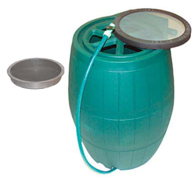
Check screens often for tears or holes - mosquitoes can fit through very tiny places