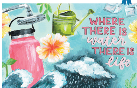
Ava Steins Grade 10