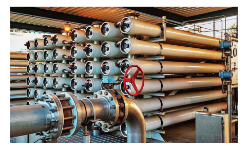
Reverse Osmosis Membranes

Recycled water is the cornerstone of West Basin's efforts to increase local water reliability. The District produces and delivers five types of customer-specific recycled water for the following purposes: