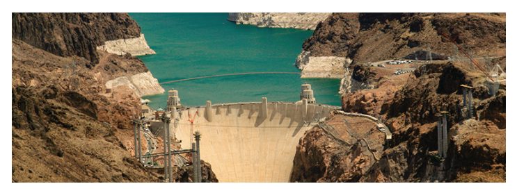
The Hoover Dam is part of the Colorado River system, located on the border of Nevada and Arizona

Since West Basin began delivering wholesale imported water from the Colorado River in 1948, the District has provided a safe, secure, and cost-effective water supply to its service area.